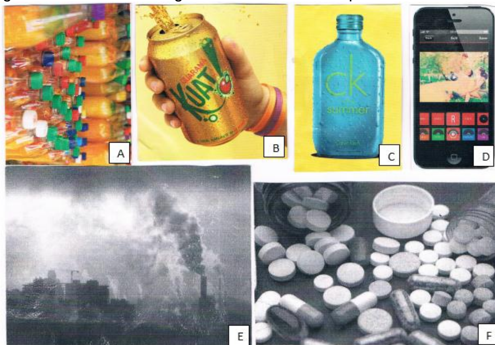
Figure 1: Selection of images associated with the presence of chemistry.